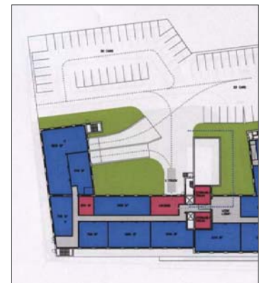
Feasibility Study for Lomax Building in Philadelphia, GMDC