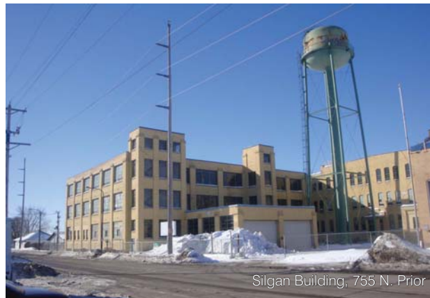
Silgan Building, 755 N. Prior